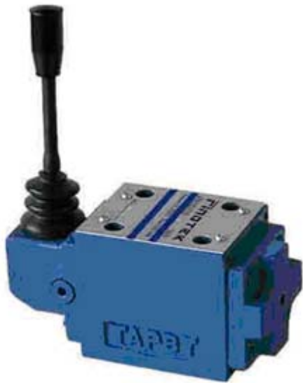
Manually Directional Valves-02