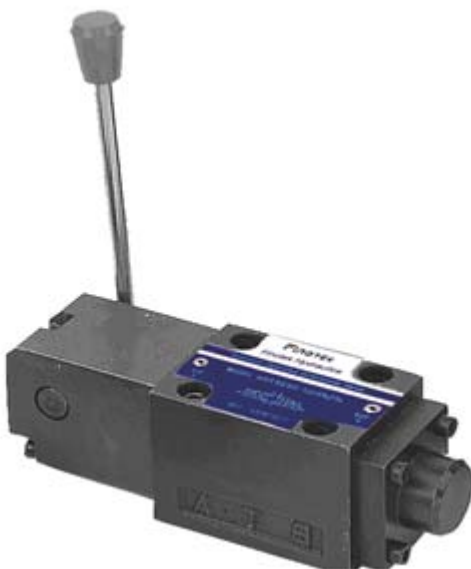
Manually Directional Valves-01

Directional spool valves , Direct operated spool valve , Hand level spool valve , Solenoid controlled directional valve , Hydraulic operation valve , Solenoid operated directional spool valve , Electrical operated